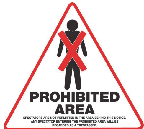
Prohibited Area For All