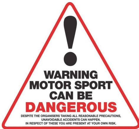
Motorsport Is Dangerous